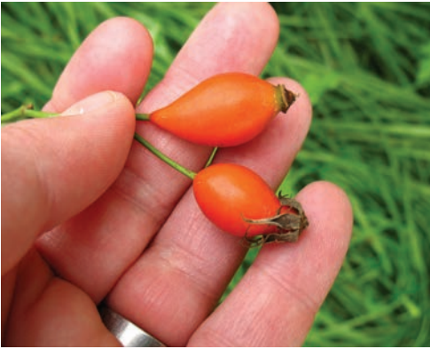
Figure 2. Example of a species found on Rutgers University's Cook Campus: rosehips from Rosa canina (Rosaceae), easily identified based on its leaf and fruit characteristics.

Of the 580 observations, the most commonly reported species was Trifolium repens (white clover, Fabaceae), which was reported 15 times. The most species-rich family for this late fall time period was unsurprisingly Asteraceae, which included 27 species on campus (10.5% of all species reported). The genus with the most species was Polygonum (Polygonaceae), with nine different species. Approximately half of the reported vascular plant species can be considered weedy species (listed in floristic works on weeds and/or invasive species), either native or non-native. Thirteen of the species found are classified by the USDA as invasive plants in the Northeast.